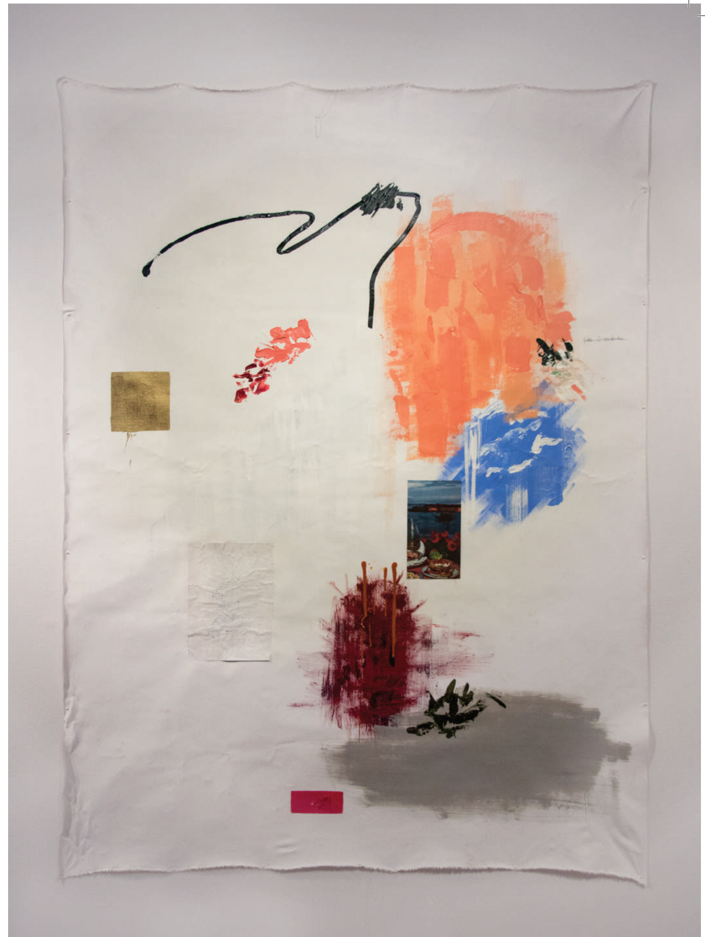
(right) Petra Lee, Deconstruct , 2017. Paint and photo collage on canvas, 4' x 6'.