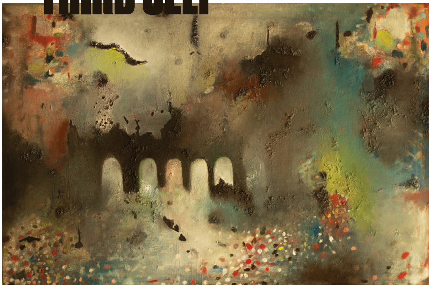
Mirela Kulović, Mystic Land , 2018. Oil on canvas 24x36in.

“Who am I?” can be a thorny but fundamental query that follows us throughout our lives. For those of us living between or among two or more cultures, defining a singular identity can be daunting, and definitions are bound to change over the course of a lifetime. Relocating to a new country presents various challenges—not the least of which are feelings of disconnection and isolation from familiar surroundings, people, and language. Where immigration and identity intersect can be a lonely and confusing dimension, but it can also be a fertile ground for creativity and exploration.